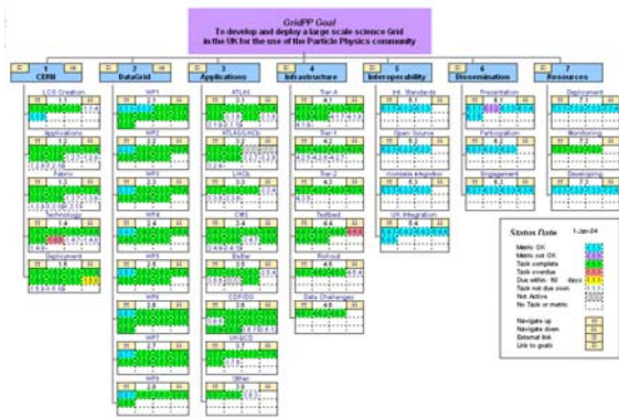
Figure 2: Project Map showing project areas and elements.

The project map initially defined 233 tasks across the whole project of which 145 (62%) had been successfully completed by January 2004, including all of the EDG tasks. Because GridPP is a development project the definition of the tasks needs to be allowed to evolve with time and this is accomplished using a 'Change Form' that documents why a deliverable needs to be modified or in rare cases deleted. In addition to the tasks there are metrics, such as the number of papers produced or workshops held, mostly in the areas of Interoperability, Dissemination and Resources. All but one of a total of 44 such metrics were within specification in January 2004.